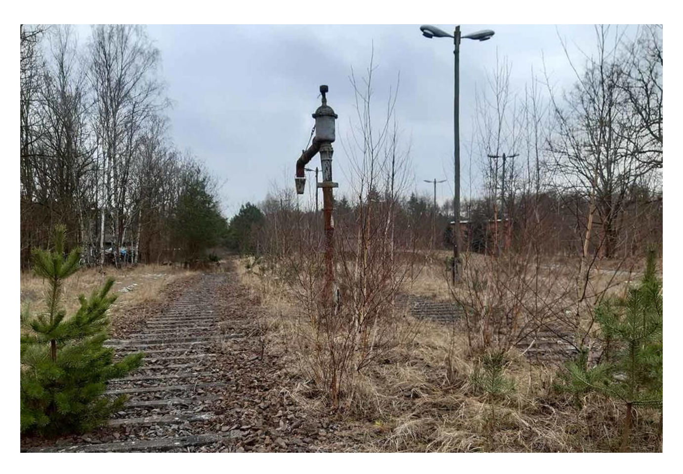
Figure 2: Former railway station Jamlitz – part of the new cycle path