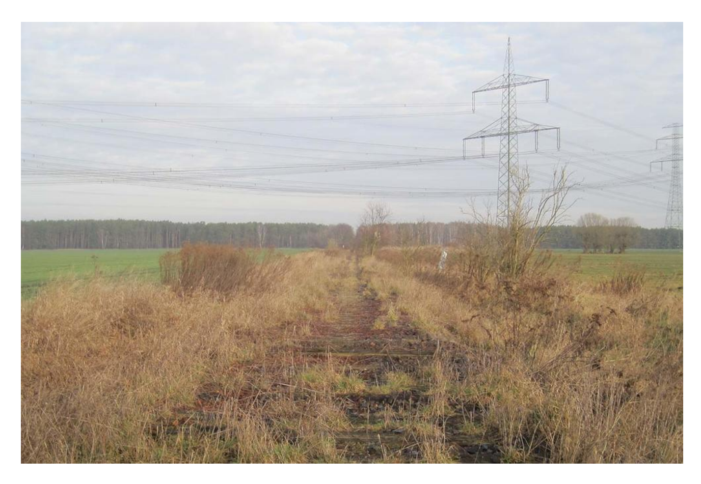
Figure 1: Former railway track in the north of Preilack – part of the new cycle path