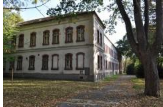
Fig. 2: The barracks building at Martinský Hill, Nitra, Slovakia.