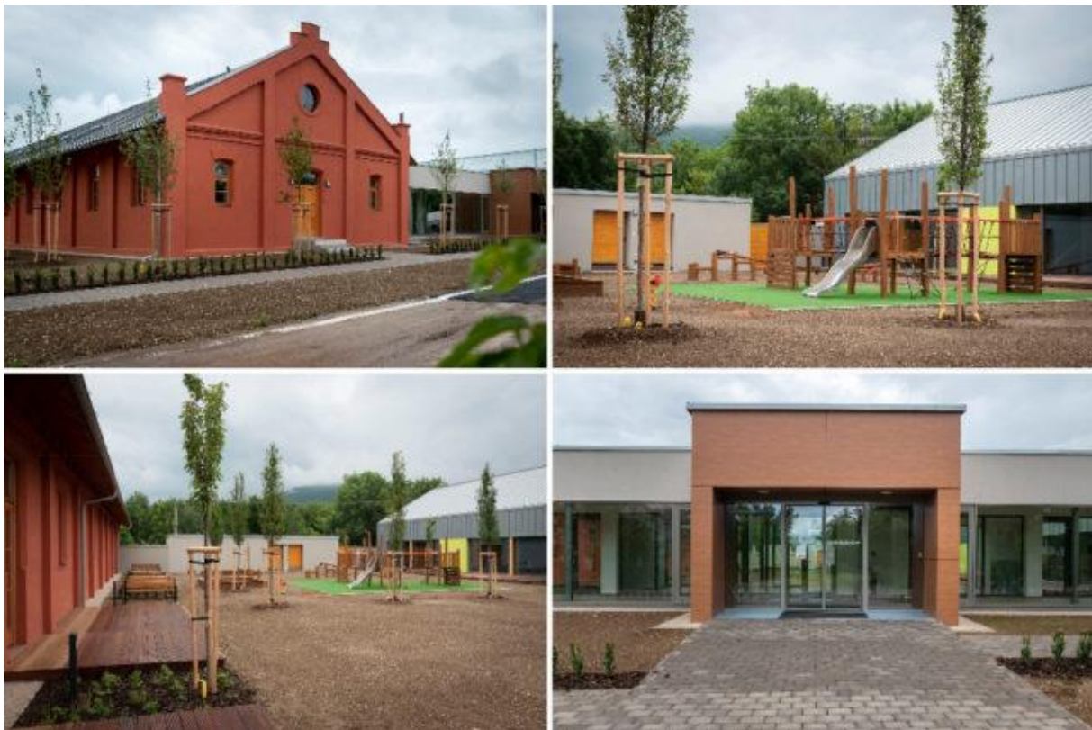
Fig. 3: The new kindergarten building at Martinský Hill, Nitra, Slovakia.

Currently, part of the premises is used on a daily basis for the purposes of said kindergarten (Fig. 3) and another part is accessible for safety reasons (ongoing reconstruction of buildings, overgrown trees...) for the implementation of specific activities listed below.