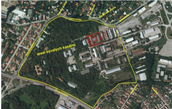
Fig. 1: The area of the former barracks at Martinský Hill, Nitra, Slovakia.

In the Great Moravian part of the Archeopark, 4 semi-buried buildings are presented, three of which are with an above-ground log structure and one is built on stilts and has the so-called woven and clay-smearred walls. Another restored object is the free-standing clay dome bread oven with a pre-oven pit.