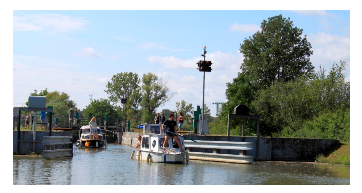
Figure 6. Bat'a channel. The Bat'a channel, originally built in the 1930s for the transport of coal from the Hodonín Basin to Bat'a's factories in Otrokovice and Zlín, manifests a complementary attraction to cultural tourism in the Moravian South.

Militaria in the area relates to twentieth-century history. There are light fortification objects on the border, which were built before WWII against Nazi Germany. Newer history is represented by the Iron Curtain memorial in Čížov. Technical monuments include windmills in Lesná and Kuželov and the Baťa Canal, which is directly used for cultural tourism (Figure 6). The canal was built by the Baťa company in the 1930s to transport coal from Hodonín to Baťa's factories in Zlín and Otrokovice.