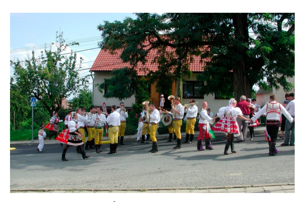
Figure 5. Living folklore. The band Šardičanka in Pavlov village. In this case, it is an attempt to export folklore from traditional Moravian Slovakia to villages settled by German populations before WWII.