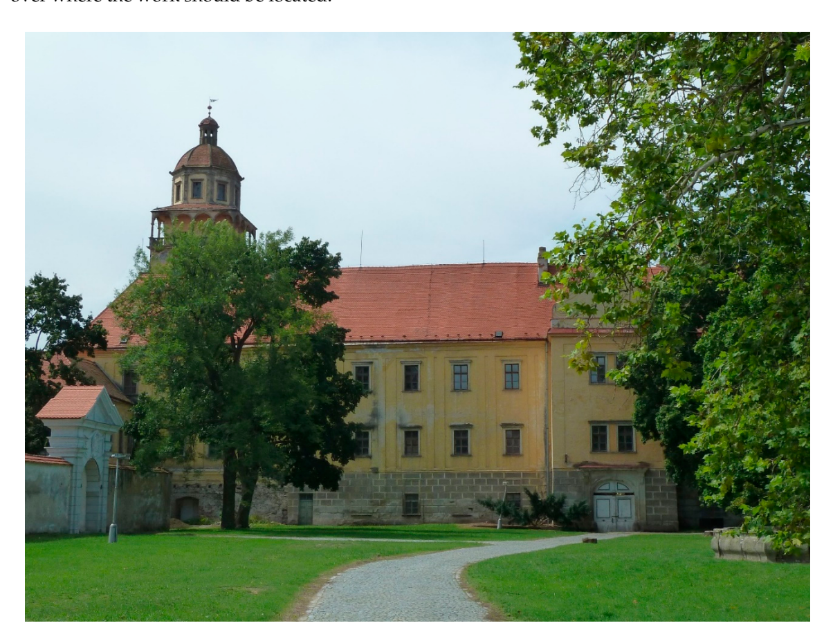
Figure 3. Moravský Krumlov Chateau. The Slav Epic has been exhibited in the Moravský Krumlov Chateau. However, the contemporary state of the building does not match the importance of Mucha's work.

The Slav Epic represents a special case of cultural heritage. It is a set of 20 large canvases painted by Alfons Mucha in the Art Nouveau style at the beginning of the 20th century. The work displays the history of Czech and other Slavonic nations and was at one time saved and exhibited in Moravský Krumlov Chateau (Figure 3). At present, there is a dispute between Prague and Moravský Krumlov over where the work should be located.