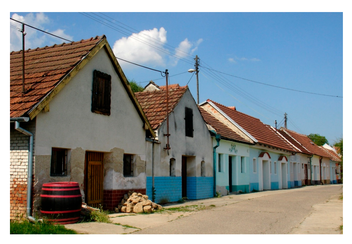
Figure 4. Wine cellars in Bořetice. The cellars manifest a part of the Free Federal Republic of Cow Hill.