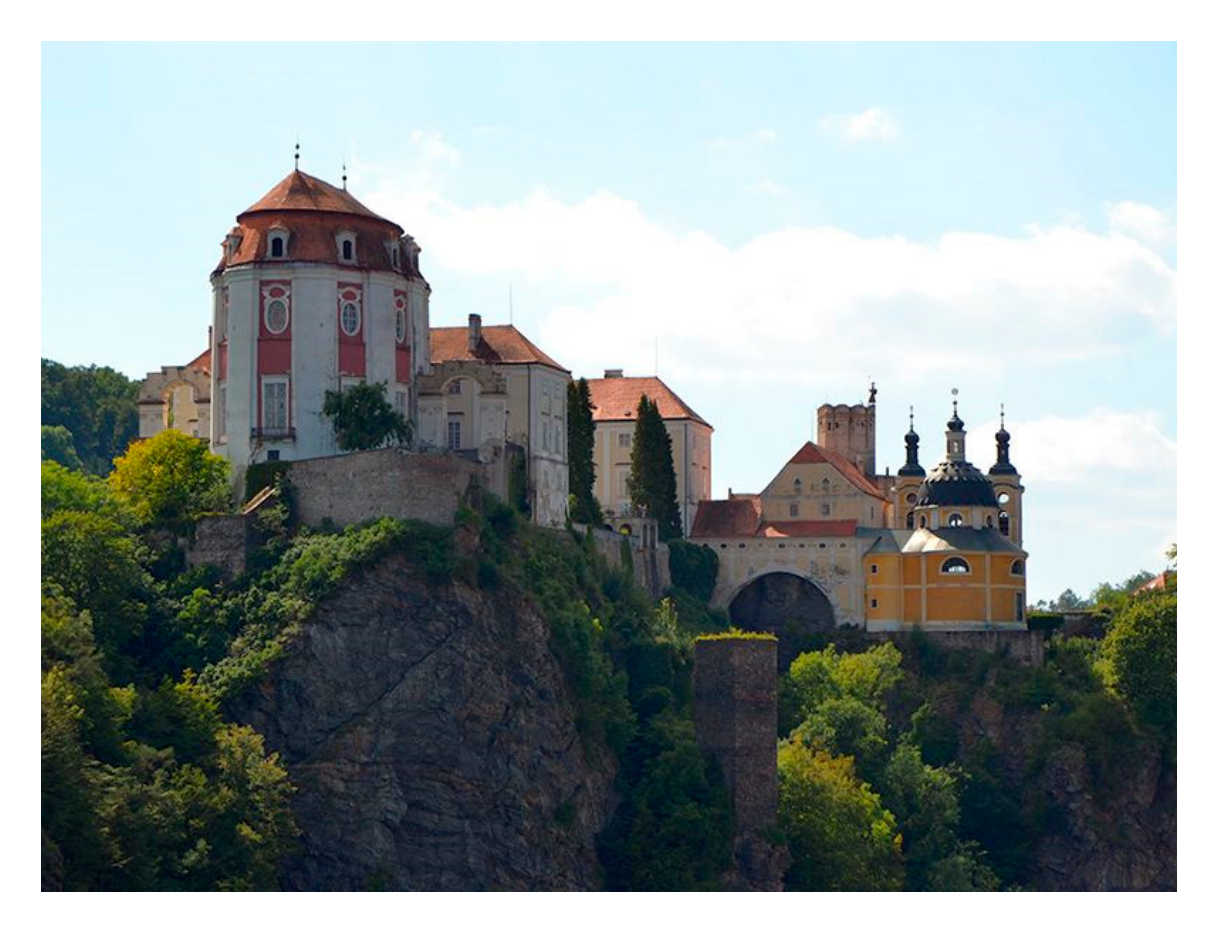
Figure 2. Vranov Chateau. The chateau dominates the Dyje valley.

state institutions like the National Institute of Folk Culture in Strážnice. Parks in English or French styles usually belong to individual chateaus. The ruins of castles (Cornštejn or Dívčí hrad belong to the best known) are accessible without any limitations. Other buildings are private and serve different purposes (e.g., a hotel in former Templar castle Čejkovice). Some objects are under reconstruction. There are four rural memorial zones protecting folk architecture in the region. Wine cellars are typical constructions in the area and are most concentrated in Petrov village.